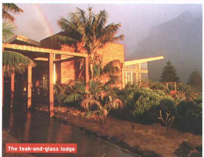
The teak-and-glass lodge