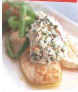
From the Capella dining room