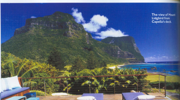
The view of Mount Lidgbird from Capella's deck.