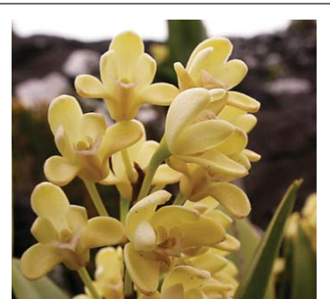
Bush Orchid blooms

We will have the chance to view their early courtship behaviour during an evening excursion. Ian will also provide an insight into recent research projects concerning the Muttonbirds.