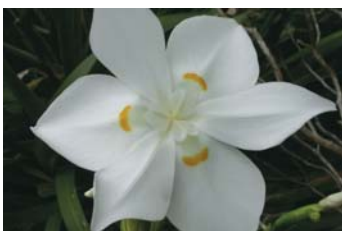
Wedding Lily in flower

Day 8 – Today is an early start for those wanting to experience one of the best day walks in Australia; Mt Gower. At 875 metres, this compelling mountain has the highest summit on the Island, and is high on many people's lists of walks to complete. Much of the terrain is rugged and the ascent is strenuous, however this rewarding climb will be one of the highlights of our visit. The 8km return walk from the sea to the summit takes us through a stunning diversity of plant and animal life. If we're lucky, the views from our lunch spot will be spectacular as the island stretches out before us. Alternatively, for those not quite as keen to tackle 'the big one' there is the easier option to climb to the Goat House. This shorter, exhilarating walk will take us 400m, as high as it's possible to climb up Mt Lidgbird. Here the views are breathtaking and well worth the walk.